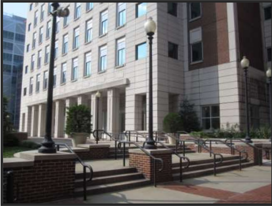
Shapiro Center CAES Meeting and Breakfast