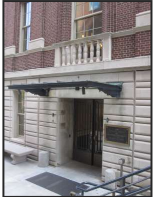
Faculty House CAES Dinner