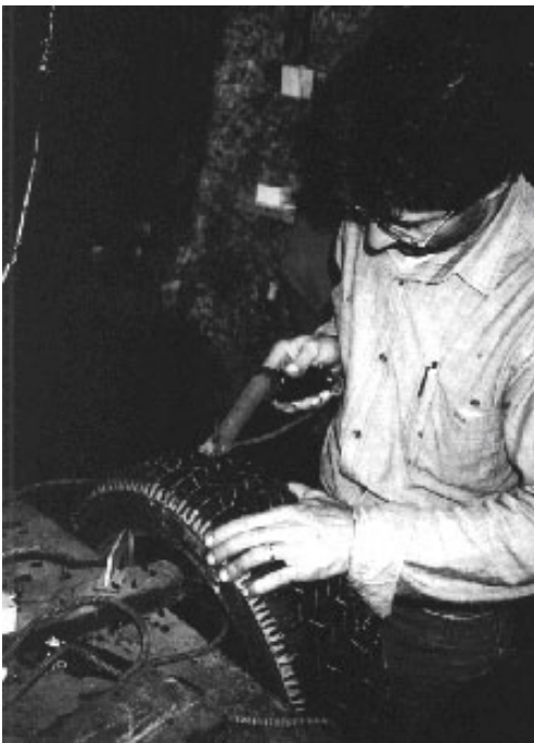
Figure 3: Following the grooves is a Labour –intensive process.

Secondary reuse of whole tyres is the next step in the waste management hierarchy. Tyres are often put to use because of their shape, weight, form or volume. Some examples of secondary use in industrialised countries include use for erosion control, as tree guards, in artificial reefs, fences or as garden decoration. In developing countries wells can be lined with old tyres, docks are often lined with old tyres which act as shock absorbers, and similarly crash barriers can be constructed from old tyres. Old inner tubes also have many uses; swimming aids and water containers being two simple examples.