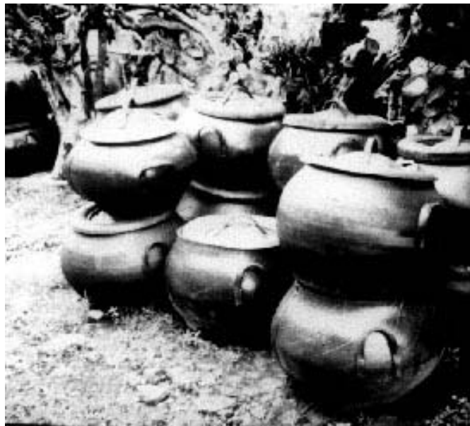
Figure 4: Garbage containers made from Truck tyres. Manila, The Philippines

Another way in which physical reuse can be achieved is by reducing the tyre to a granular form and then reprocessing. This can be a costly process and there has to be a manufacturer willing to purchase the granules. Crumb rubber from the retreading process can be used in this way, as it is a good quality granulated rubber. The reprocessing techniques used are similar to those described in earlier chapters. Granulate tends to be used for low-grade products such as automobile floor mats, shoe soles, rubber wheels for carts and barrows, etc., and can be added to asphalt for road construction, where it improved the properties of this material.